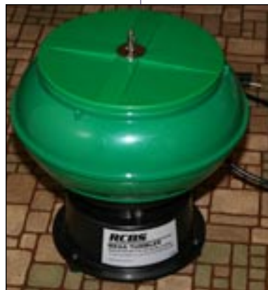
Tumbler to polish the cases .