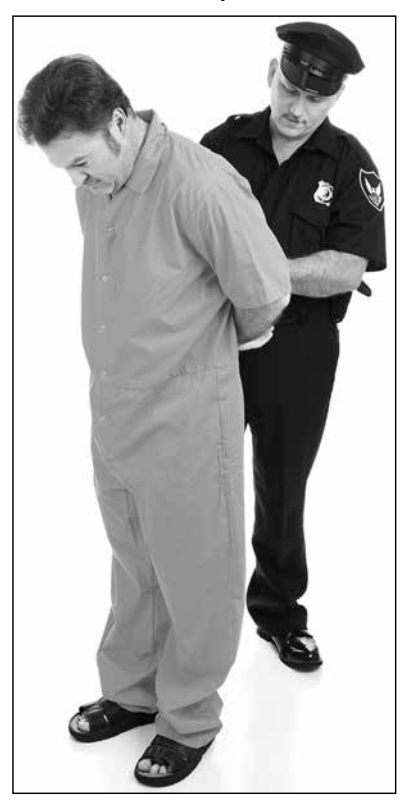
You could be arrested for assault with a deadly weapon after defending the wrong person.

locale, this would likely be prosecuted as a case of second degree assault or assault with a deadly weapon, because the guy on the ground who you thought was an innocent victim is actually the one who started the altercation. He does not have a right