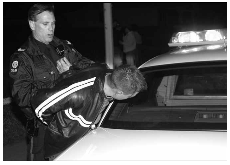
There is no simple answer to the question of how much you should tell officers responding to a shooting scene, but that choice has serious implications, so must be considered in advance.

If you refuse to talk to the responding officers, it is extremely likely that you will be arrested—maybe not 100% of the time, but often enough that you should plan