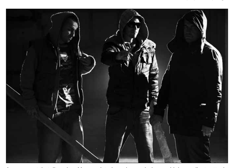
An argument that disparity of force existed may be used when multiple assailants attack.

Legally speaking, likely it was lawful for the defender to use force in self defense, but in court the claim is made that he or she used excessive force. Under these circumstances, the defendant will need to show the jury, or a judge