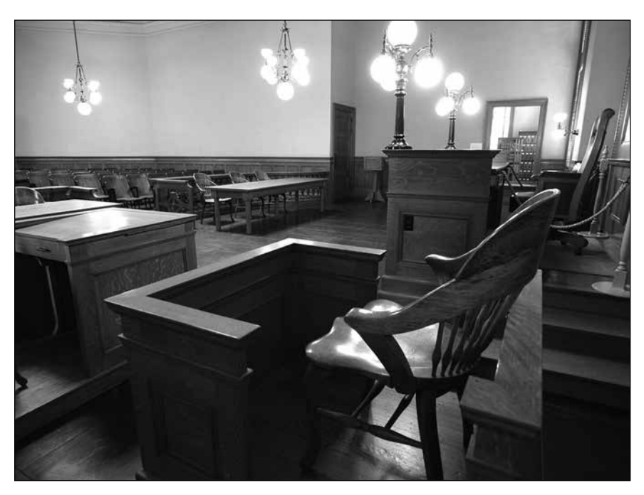
Sitting in the witness' chair and at the defendant's table in a courtroom is one of the possible outcomes of being involved in a self-defense shooting.

These are only some of the reasons gun owners must understand when it is justifiable to use deadly force in self defense, as well as learning what to expect from the legal system if they are left with no viable alternatives and must shoot an attacker.