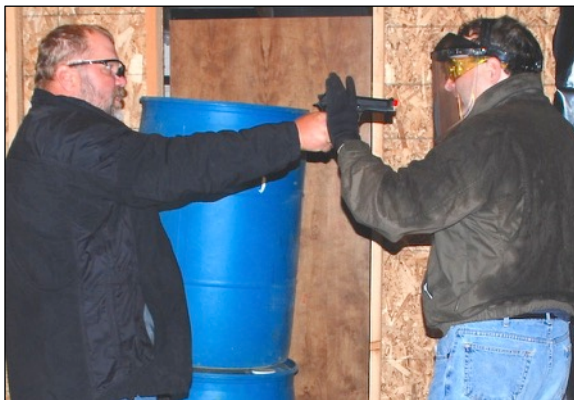
Airsoft pistol used in force on force training with appropriate safety gear worn by student.

Have you ever trained in decision-making scenarios? If not, that is a huge hole in your preparation to use deadly force in self defense. When I started my training school, I modeled the curriculum after that of a police academy, modified, of course, for the armed citizen. We have four levels of handgun training, culminating in level four working extensively on decision making and force on force scenarios. Why? So our students can go in front of a jury and explain that they have been trained in exactly the same subject matters in which law enforcement officers are trained and that they used their training to assess the situation, then took the best options available to them at the time. And of course, to back up that assertion, I stand ready to go to court for any of my students and explain the rationale behind our curriculum.